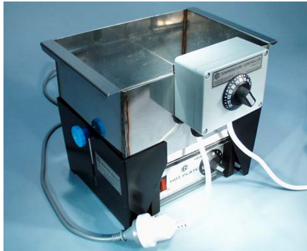
View showing the temperature sensor fitted and connected.