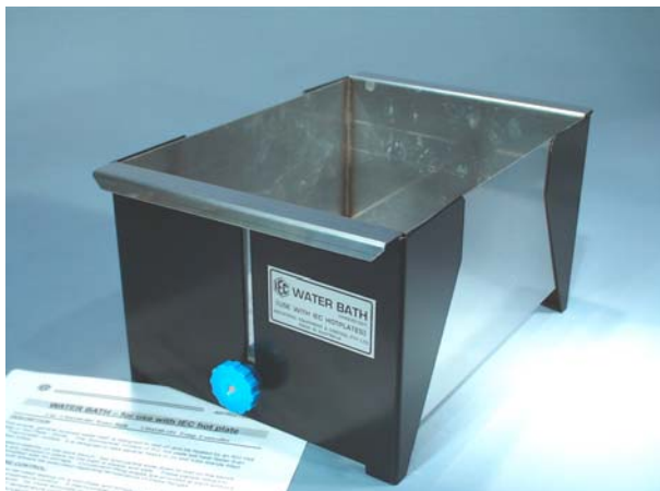
Reduced to minimum size for storage