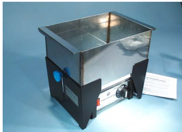
Ends extended for maximum stability

Physical size: Bath internal: 260x180x125 LxWxD Wt: 2.2kg