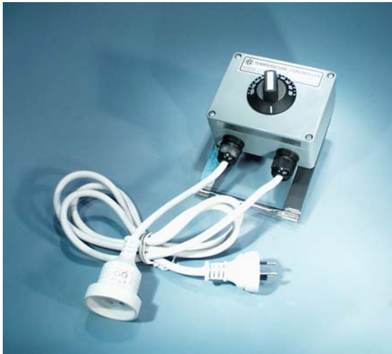
View of the temp.controller CH4240-101 ..... Must be purchased separately